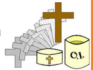
Sacrament of Anointing

HEALING MASS - The Mass of the Anointing of the Sick will be celebrated at our 11 AM Mass on Sunday April 26th at 11am. If you wish to receive the Sacrament of Anointing of the Sick, please call the parish office at 215.343.0315 or complete this form and place it in the collection basket. Extra forms are located in the back of church: