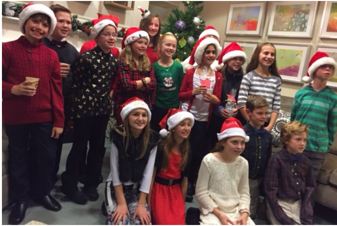
ST. ROBERT'S CHILDREN'S CHOIR - The children's choir performed at the Solana of Doylestown on Thursday evening Dec. 10th. They had about 25 children & the residents were touched.

GETTING MARRIED? Check out our recently updated web page. Go to saintrobertwarrington.org then Adult Faith Formation and then Sacrament of Matrimony .