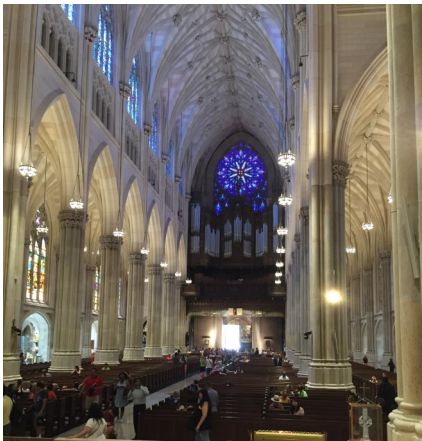
The recently restored Cathedral

A private altar where Popes and other church dignitaries have offered Mass