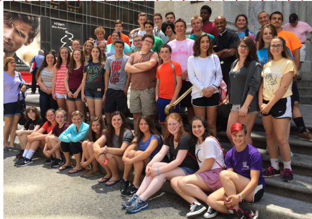
The group outside of St Patrick's Cathedral

★ DAY 1 of our pilgrimage/ ★ mission trip/youth ★ conference visit and tour of ★ St. Patrick's Cathedral