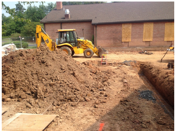
Preparing for the new entrance and cry room addition to the front of the church.