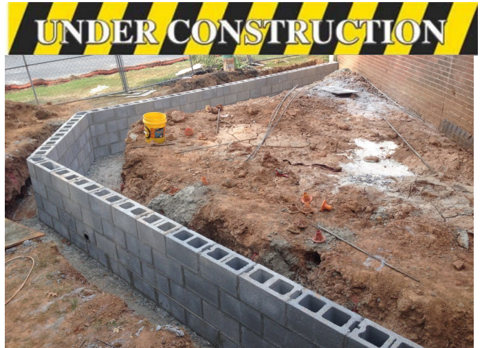
Preparing to concrete pads for placement of the new air conditioning units.