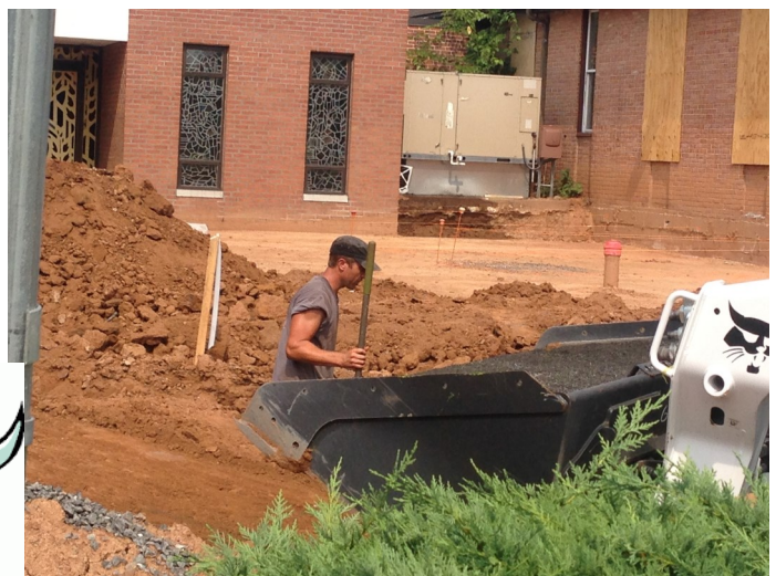
Preparing for extension of the narthex and the placement of the new expanded restroom facilities.