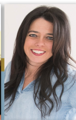
Keynote Speaker KRISTIN SMEDLEY

Mount Saint Joseph Academy The Mount, a catholic preparatory school for girls, invites all interested 7 th grade girls to The 7 th Grade Practice Test (Pre-HSPT) to be given on Saturday, March 21, 2020 8:00 – 11:30 a.m. The Pre-HSPT is a 7 th grade edition of the actual Scholarship/Entrance Exam given to eighth grade applicants. Registration is available online only . Register at: www.msacad.org/practicetest You will receive registration confirmation via email.